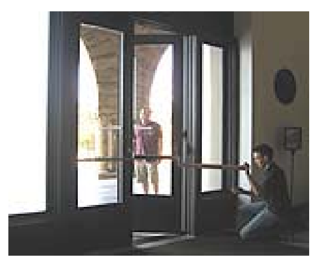
Figure 1. Wizard of Oz setup. A hidden door operator uses a mechanical armature to gesture the door.

attached to the door's push bar. We used gaffer's tape to hide the armature and Contact Paper to obscure the windows to the sides of the door to create the illusion that the door was opening on