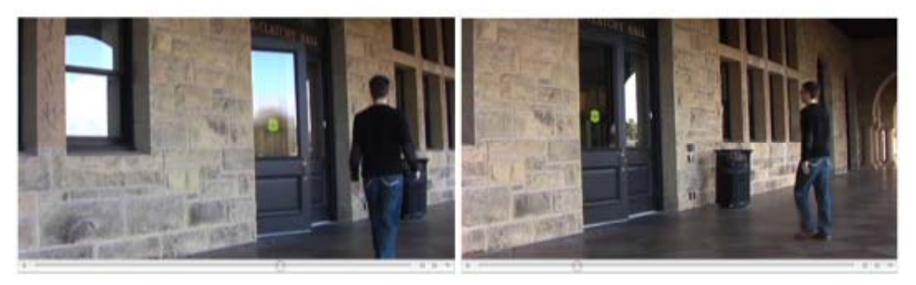
Figure 4. Screenshots of video of person walking by (left) and toward (right) the gesturing door

This study added one new dimension, door speed, to the previous study design. Using a 2