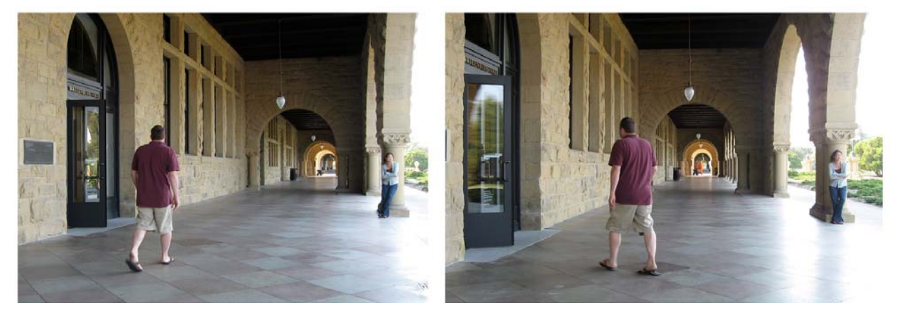
Figure 2. Person walking (a) by and (b) towards the door. Note the monitor on the right.

The procedure for the study required three to four experimenters. One was the door operator mentioned earlier. Another experimenter acted as a monitor, waiting casually outside of the building and surreptitiously triggering an alert to the door operator inside via walkie-talkie when