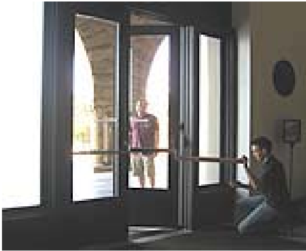
Figure 1. Wizard of Oz setup. A hidden door operator uses a mechanical armature to gesture the door.

attached to the door's push bar. We used gaffer's tape to hide the armature and Contact Paper to obscure the windows to the sides of the door to create the illusion that the door was opening on