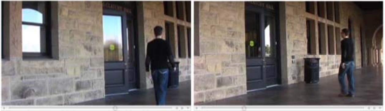
Figure 4. Screenshots of video of person walking by (left) and toward (right) the gesturing door

This study added one new dimension, door speed, to the previous study design. Using a 2