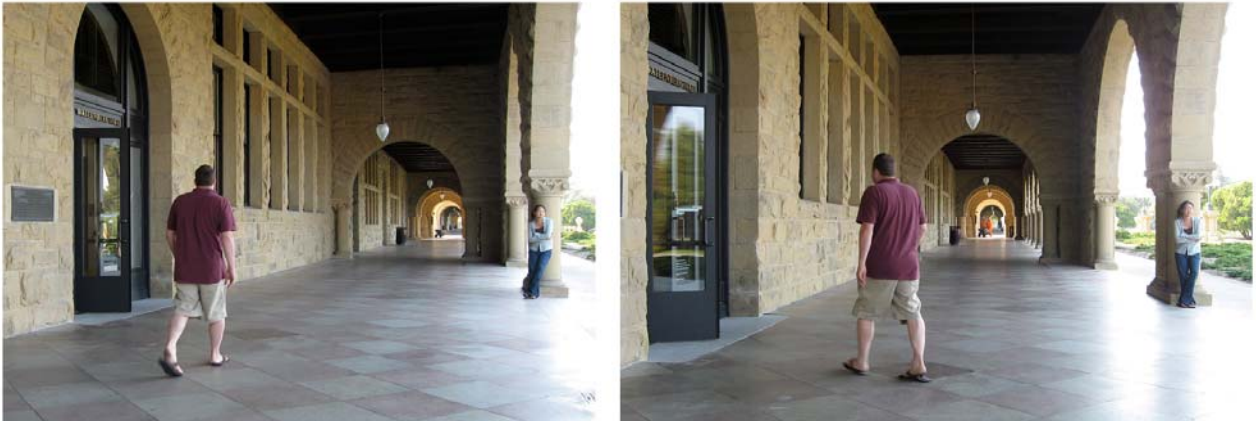
Figure 2. Person walking (a) by and (b) towards the door. Note the monitor on the right.

The procedure for the study required three to four experimenters. One was the door operator mentioned earlier. Another experimenter acted as a monitor, waiting casually outside of the building and surreptitiously triggering an alert to the door operator inside via walkie-talkie when